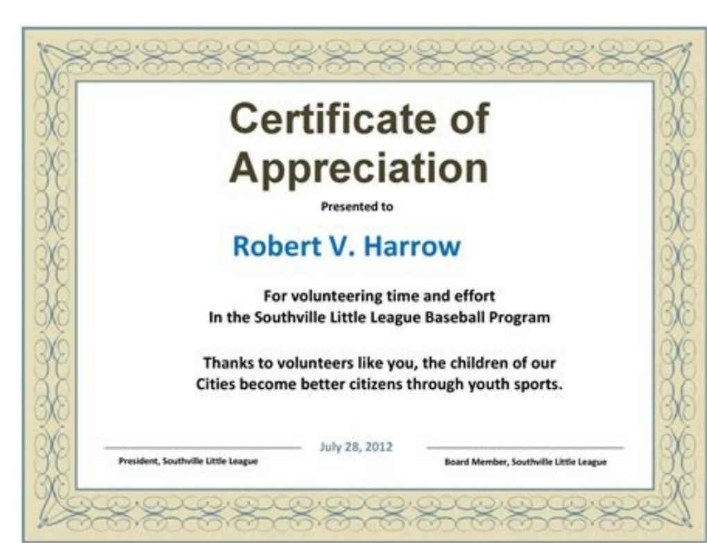
Sample format of certificate of appreciation. Sample certificate of appreciation word format.